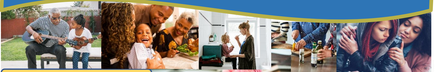
For grandparents raising grandchildren