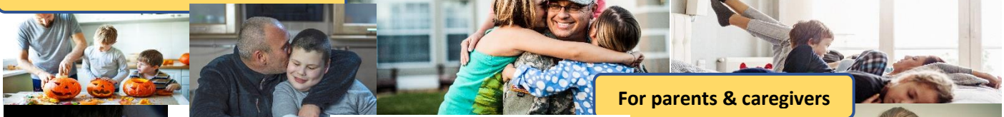
For parents & caregivers